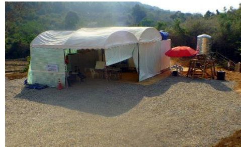
Quality Control laboratory and field testing provided by Geotech International for the construction of the Houay Naking Sediment Management Dam – Lao PDR