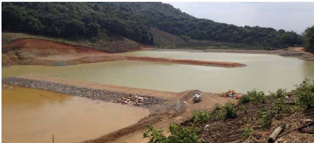
Houay Naking Sediment Management Dam and Sediment Retention Pond completed and under full operation – Lao PDR