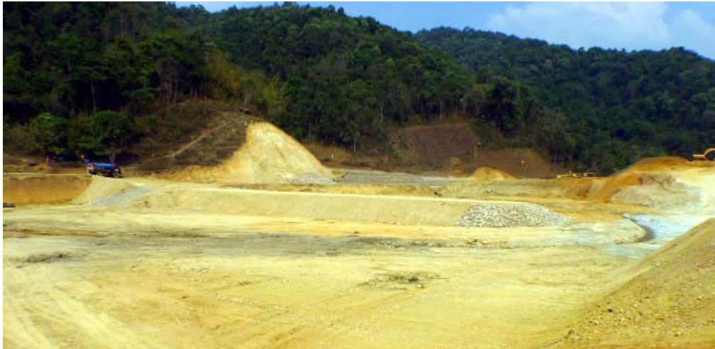
Houay Naking Sediment Management Dam and Sediment Retention Pond under construction – Lao PDR